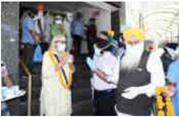
The first batch of patients being sent home.

Active health education through various means including multimedia messages are in place in keeping with Mission Fateh activities.