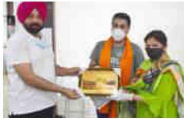
The first donor of convalescent plasma being felicitated.